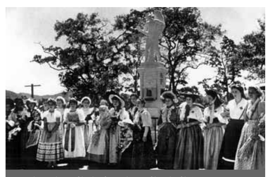
Women in the provincial costumes of their places of origin on the occasion of the unveiling of the Canecutter monument on 4 October, 1959.

Printers, 1973. The Evening Advocate – 9th December 1958; 15th January 1959; 6th April 1959; 7th September 1959; 5th October 1959. The Cairns Post – 24th March 1959; 5th October 1959.