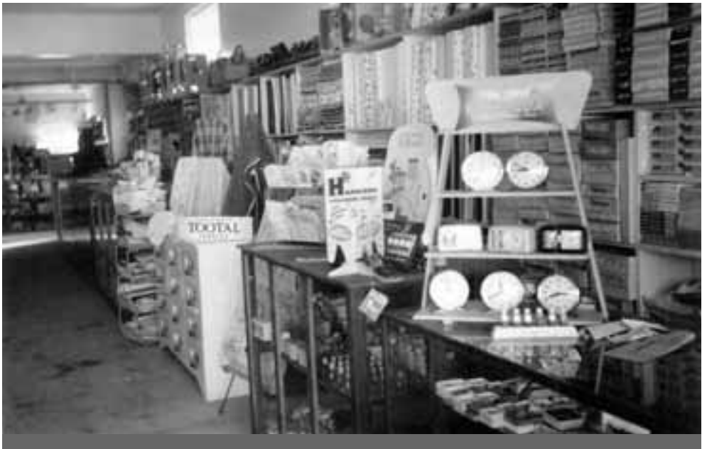
Inside the Vadala Drapery Store