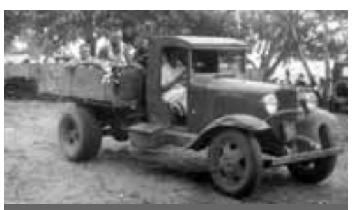
Sam Pagano driving his truck behind the trees at Etty Bay, the ever popular beach.