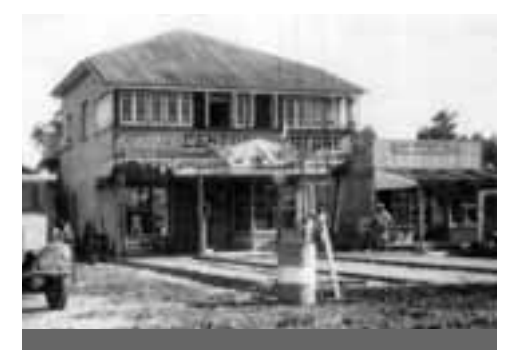
Speziali's bus service business also included a fuel depot and cartage of coal for locos. Giuseppe Galetta was a partner. The third generation of the Speziali family still run a garage (mechanics only) on the original allotment of the bus service.