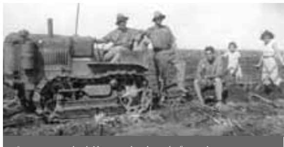
Sometimes even the children joined in doing the farmwork