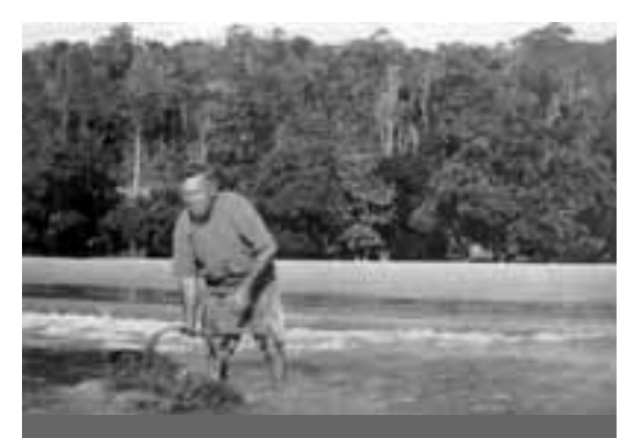
Getting bait for fishing.