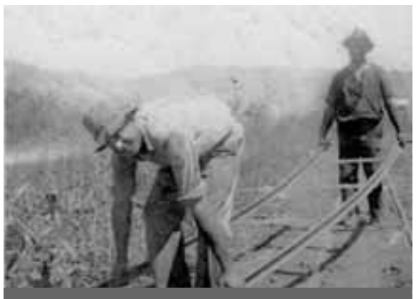
Men putting down tram truck