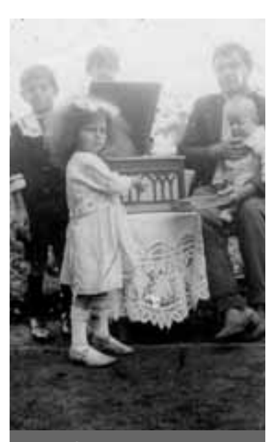
The Cali family enjoying their new gramaphone, 1923.