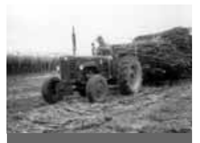
Hauling hand loaded cane trucks on portable tramlines.