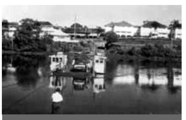
The ferry crossing the Johnstone River, with the hospital in the background.