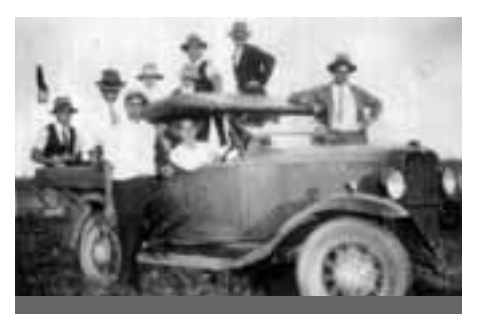
Pensini men and friends setting out for a soccer match.