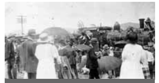
A crowd celebrating the first train to cross the bridge over the North Johnstone River.

The number of cars appearing in family photo albums attests to both the popularity of the car and the prosperity of the district.