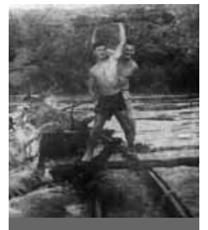
A flooded river and cane train bridge.