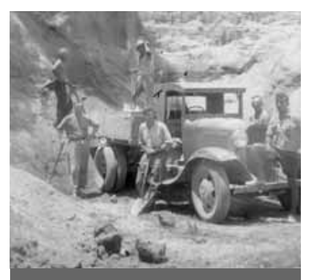
Men digging sand to make a new road through the bush.